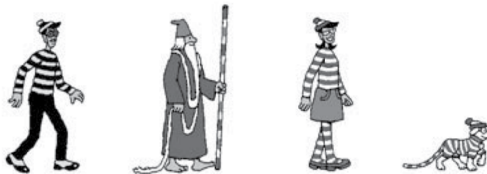
WHERE'S WALLY? WORDSEARCH